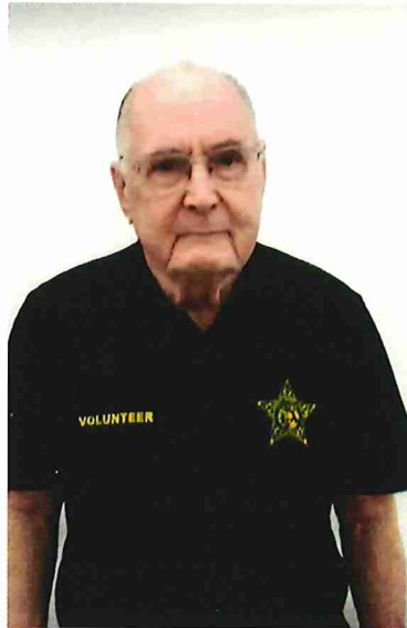
We are thankful to the Lord for the open door to preach and teach the Word.