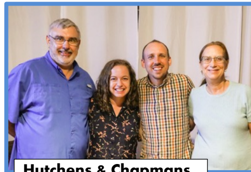
Hutchens & Chapmans