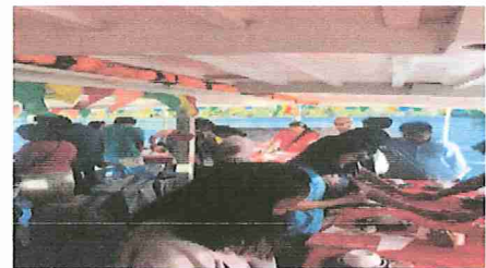
Baptism of Bro. Gregory from Florida Couple's Fellowship– Honoring God through our marriage