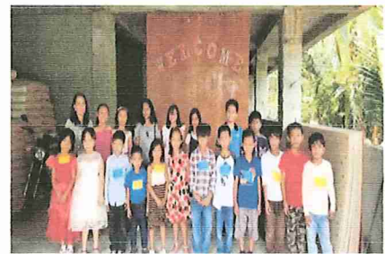
Katipunan outreach-first mission service Young People's Banquet My wife with her Sunday School kids