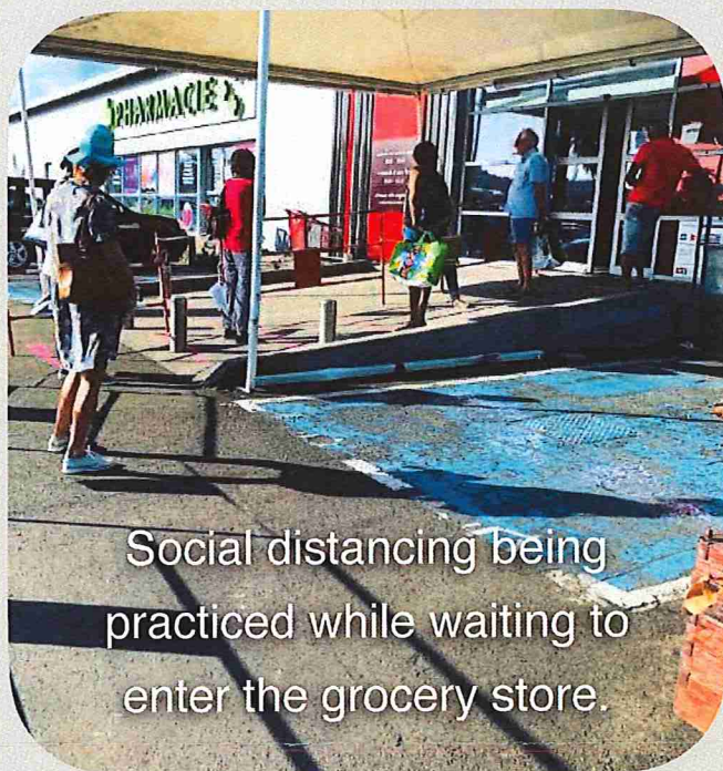
Social distancing being practiced while waiting to enter the grocery store.

Would you pray with us that God will protect, heal and be glorified through this? Our prayer is that God would give us opportunity to bless and help others through this time as He directs. We understand that times are uncertain in the US as well and we are so grateful for your love and prayers. Know that we are holding you all up in prayer as well!