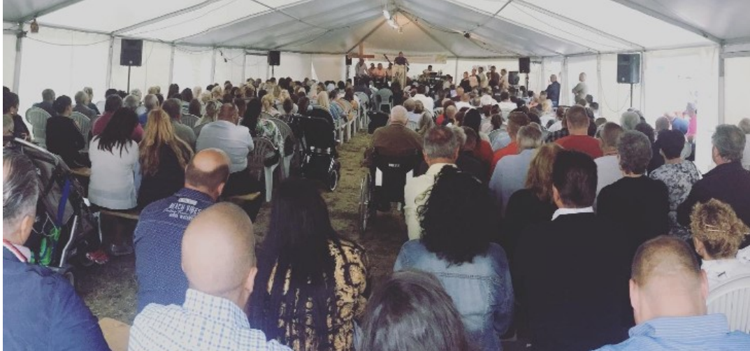
Camp Tent Service

wet. However, the tent had visitors in the 8 pm and 10 pm services. Many young people from the surrounding area came to the campground around 9:30 pm so they could be in the