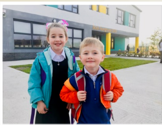
First Day of School