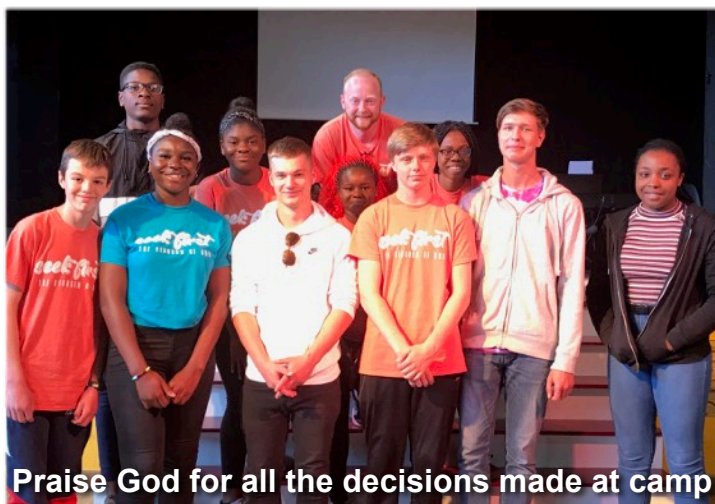
Praise God for all the decisions made at camp