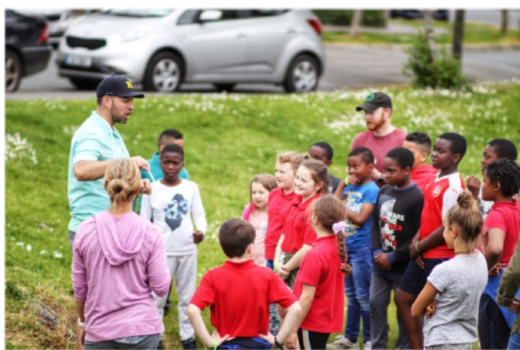
Big Green Bible Club