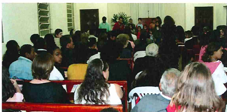
The Independent Baptist Church we worked out of.