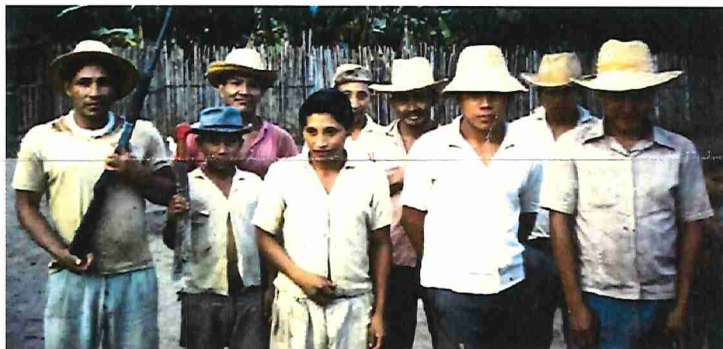
The Jaminaua men, as we first knew them.