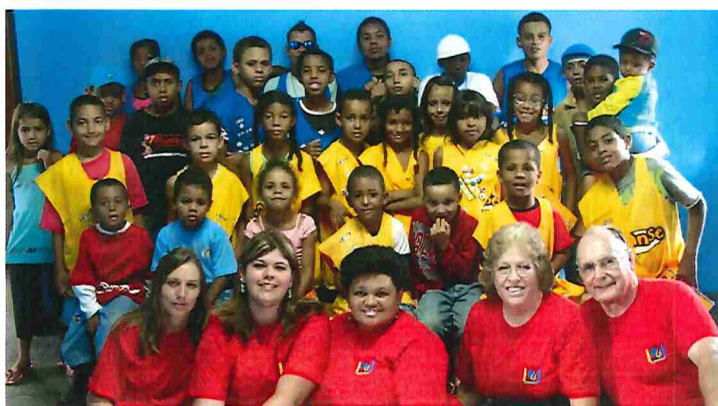
Working with children by way of a Kid's Club.