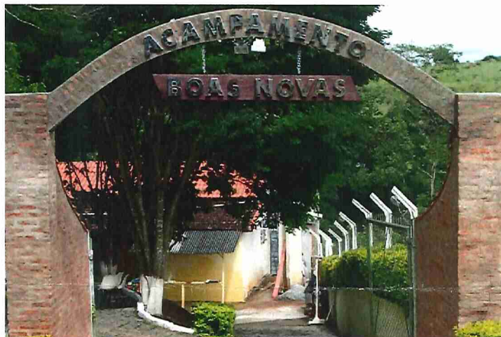
The GOOD NEWS CAMP of our church in Campo Belo.