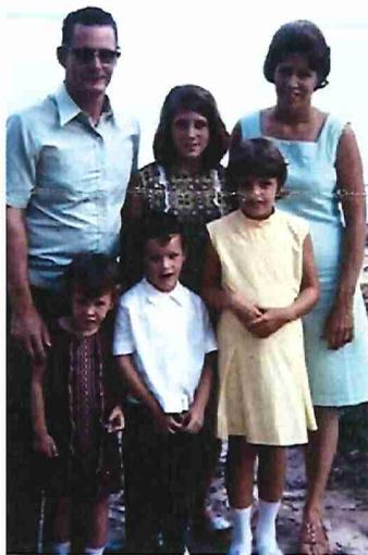
Our family in 1969, when we first began in Brazil.

It was November 1969, Thanksgiving day, when we first arrived in Brazil to begin our 44 years of service there. After studying Portuguese, and working in a Missionary Kid's school for a year, we went into the state of Acre to work with the Jaminaua Indians. It was a joy to see the first professions of faith in the Lord Jesus along with our faithful Brazilian workers.