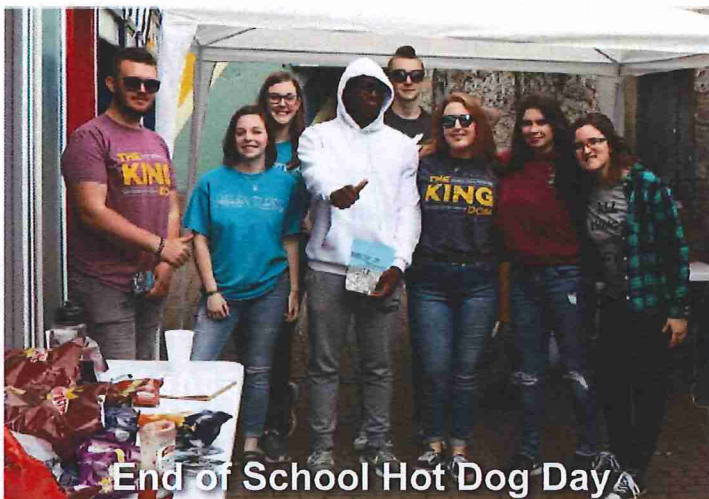
End of School Hot Dog Day