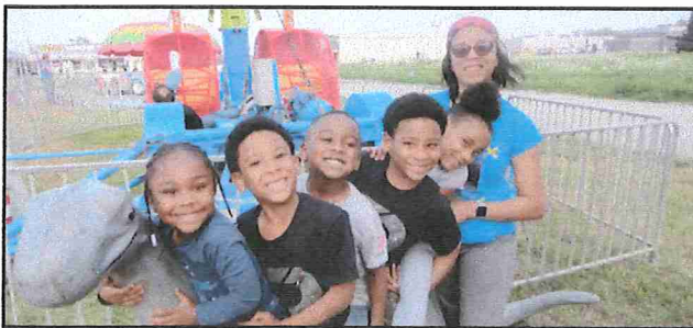
Family at a little parking lot in Bayou Vista, LA. taking advantage of our photogenic dinosaur.