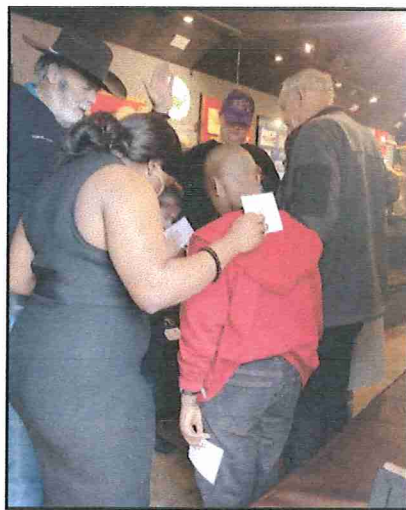
Lady asked for prayer for cancer at the railroad festival.