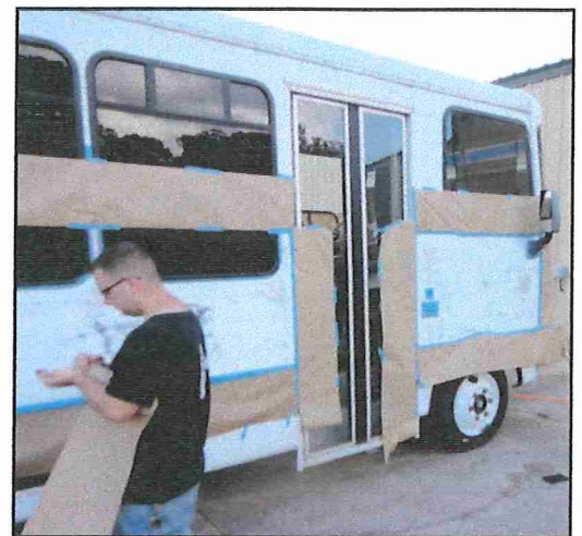
Right: Prepping the bus to get painted. It's a long process but the results are amazing.