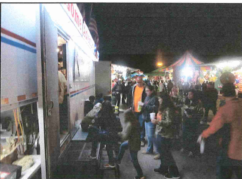
Left: At the rabbit festival, I was "hoppy" to see the crowds that were out there despite the cold.