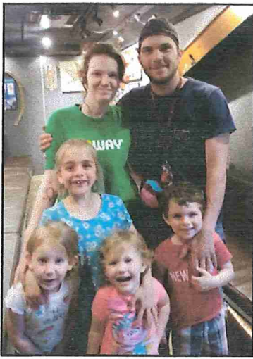
Second generation video trailer goers