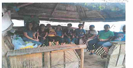
Working fellowship at the site.